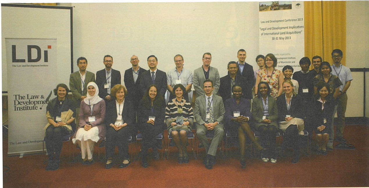
Participants of the Law and Development Conference 2013 at Kyoto University