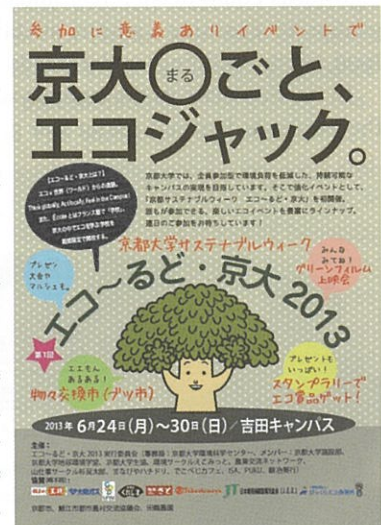
Publicity for Kyoto University's first Sustainable Week

The Graduate School of Global Environmental Studies (GSGES), one of several sponsors, supported the fair's organizing commit-