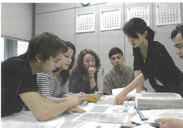
Students interview administrators about energy management on campus