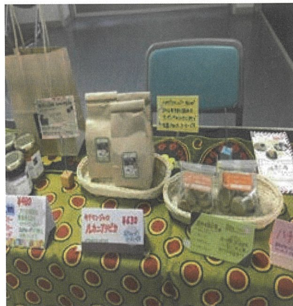
Fair-trade coffee on sale at the Green Film Festival

Finally, as part of a presentation entitled My No-Impact Day, five students studying environmental communication suggested some simple eco actions that students could carry out on a daily basis. This followed the screening of No Impact Man , a film that documents New Yorker Colin Beaven’s sometimes moving, often hilarious efforts to make no personal impact on the environment for a whole year. He strives to produce zero waste, eat vegetarian and buy only locally produced food while foregoing elevators, television, cars, buses, toxic cleaning products, electricity and material consumption. Some of the students’ suggestions were sensibly practical, for example, turning off any computer left on standby for more than 90 minutes. Other suggestions, such as living communally and rewarding oneself financially for every day a small environmental action has been carried out – or rewarding an environ-