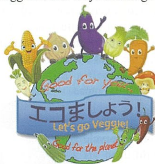
Logo designed by students for use in the Rune canteen