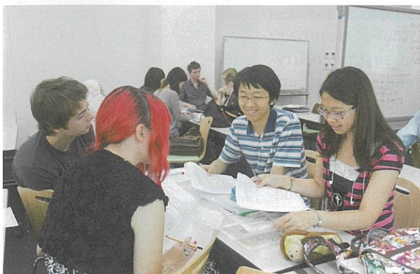
Students share the results of fieldwork in class

In the first class of the campus sustainability module, the students learned about the global green campus