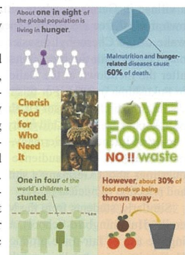
Why waste food when so many live in hunger? Poster by Gao Zheng and Tomoyo Hidekuma, GSGES

Students also praised the Kodawari Marché, which sold organic vegetables grown locally by KU students along with such goods as fair-trade and handcrafted wooden products. Yoshie Kira, a first-year master's student at GSGES, expressed her desire to see organic and natural products sold more widely in shops and supermarkets. "Vegetables